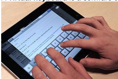
Typing on a tablets virtual keyboard

A virtual keyboard is a software component that allows a user to enter characters.